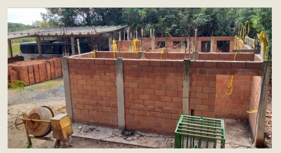
Vocational training building progress