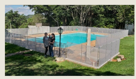
Security fencing installed for existing pool