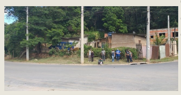
View 1 of newly purchased corner property