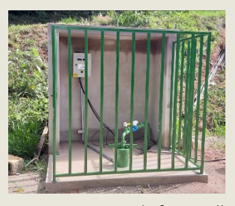
Security gate made for a well