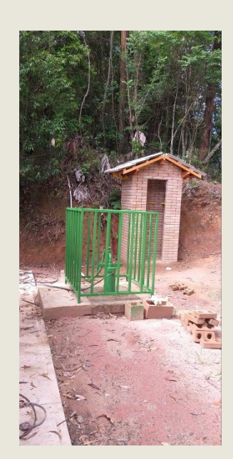
Utility box made from homemade bricks & new pump gate