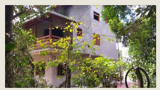
Fourth Home almost done

We had to stop going to the favelas for a while during the peak of Covid-19 for safety reasons. Nonetheless, we kept very busy! Our whole team is involved in Evangelism Explosion training, prayer groups and projects. Here are some of the unfinished projects that we were able to work on since we had more time on campus: