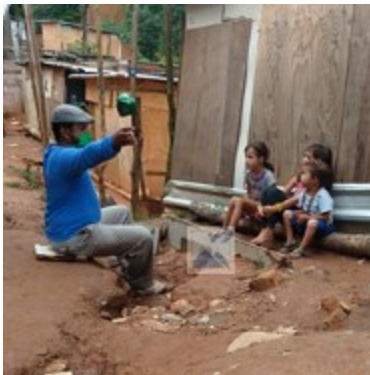
Hot meals, food baskets, cleaning supplies, hygiene kits, fresh produce, masks