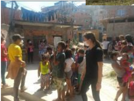
Improvements to the construction in front of our Cachoeirinha church building have been made and he is currently trying to build on the