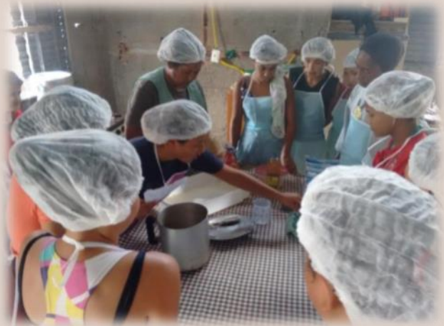
Culinary classes every Tuesday and Saturday in favela Cachoeirinha.