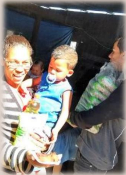
Taking home food and fresh baked goodies.

The enemy is busy destroying homes while the church is trying to bring them together. He is filling their communities with drugs but His Church fills them up with hope. The world offers temporary peace but we offer eternal peace which cannot be explained. When their homes have no food we try to fill their stomachs and empty shelves. Because of their poverty we try and lift them up by providing opportunities to learn a trade or other creative ways to create and sell products. In Favela Cachoeirinha we even offer culinary classes. If they lack clothes we provide. Instead of prostitution we offer The Way out. When we see the abandoned children roaming the streets we offer to take care of them wherever and whenever and however we can.