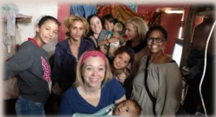
Visiting mission team from Starfish Orphan Ministry , Kentucky, taking the time to visit with and encourage families in the favela.