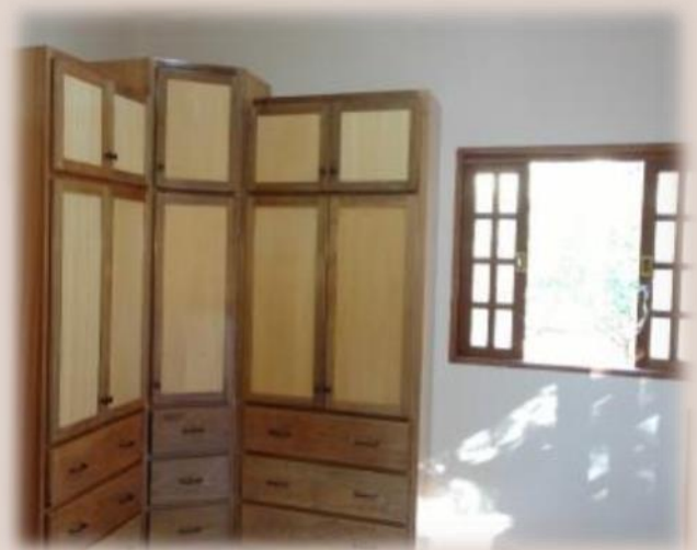
Above left: new beds - Above right: the beautiful corner wardrobe our guys made in our woodshop

classrooms for school and all types of trades. This can go up fast as most of it is put together by pre-molded concrete.