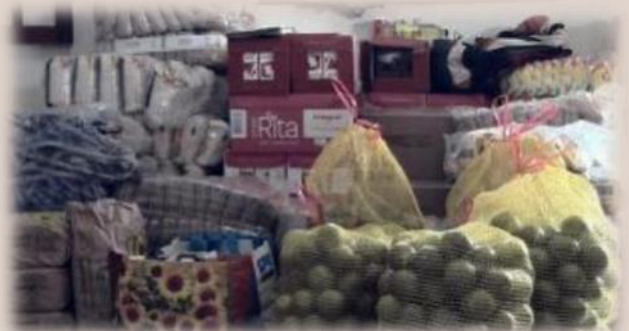
Thank you to Siloah Fellowship International for their generous humanitarian offerings with which we purchase food, formula, diapers, etc for desperately needy people.

Please pray for the vision of A.M.O. (given in 1999) as it is blossoming and multiplying. In the Name of the Lord we are breaking the strongholds of many from one generation to another. Thank you global partners for making this happen. As you, we also value bringing all the Glory to God. Thank you Jesus for Your Church!